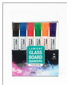
Premium Glass Markers Pk