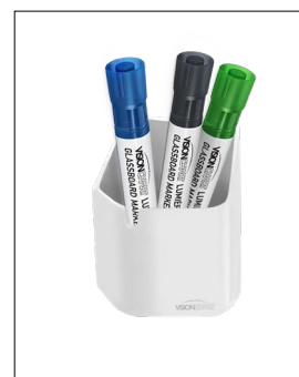
Strong Magnetic Pen Cup