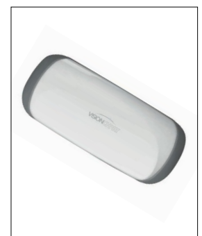
Strong Magnetic Eraser